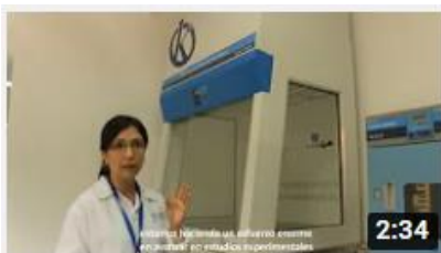
Kalstein France - Jacinto Convit Foundation / Allianc... 23 views • 3 years ago