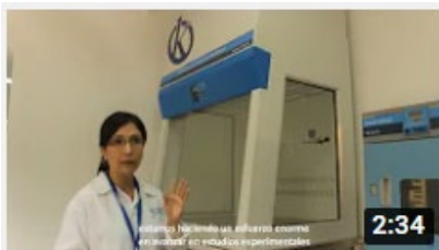
Kalstein France - Jacinto Convit Foundation / Alliances