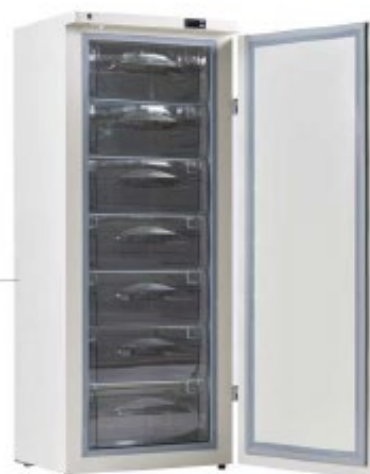
Inner 7 drawers