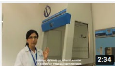
Kalstein France - Jacinto Convit Foundation / Allianc...