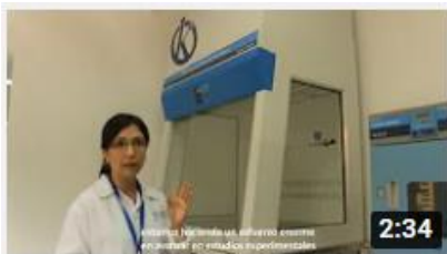
Kalstein France - Jacinto Convit Foundation / Allianc...