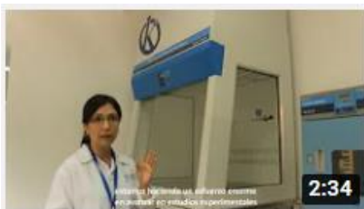
Kalstein France - Jacinto Convit Foundation / Allianc... 23 views • 3 years ago