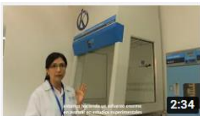
Kalstein France - Jacinto Convit Foundation / Allianc...