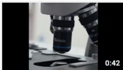
Kalstein's Microscopes 445 views • 1 week ago