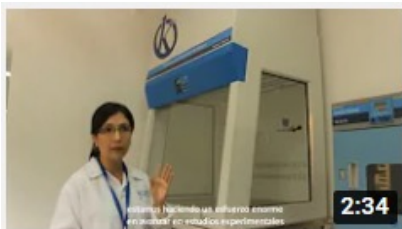
Kalstein France - Jacinto Convit Foundation / Allianc... 23 views • 3 years ago