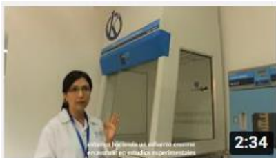
Kalstein France - Jacinto Convit Foundation / Allianc... 23 views • 3 years ago