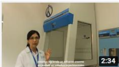
Kalstein France - Jacinto Convit Foundation / Allianc... 23 views • 3 years ago