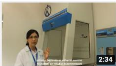
Kalstein France - Jacinto Convit Foundation / Alliances 23 views • 3 years ago