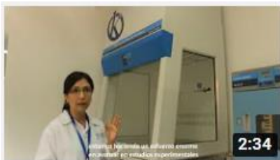
Kalstein France - Jacinto Convit Foundation / Allianc... 23 views • 3 years ago