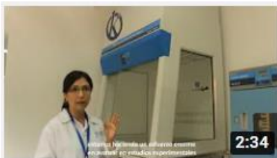
Kalstein France - Jacinto Convit Foundation / Alliances