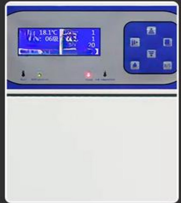
⬆ Intelligent temperature controller Intelligent LCD temperature controller, intuitive display, stable measurement and control, easy to operate