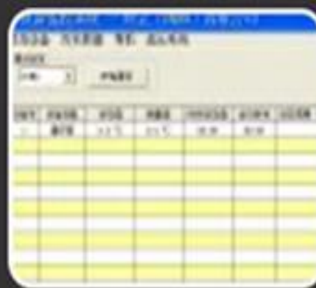
Communication interface software