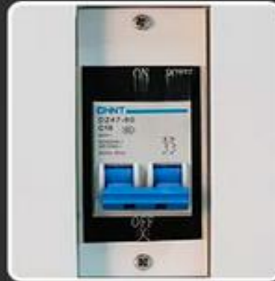
⬆ switch There is a power switch on the side, safe use of electricity