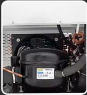
⬆ Fluorine-free balanced refrigeration system Using fluorine-free R134 refrigerant, energy-saving and efficient, green, with inlet and outlet