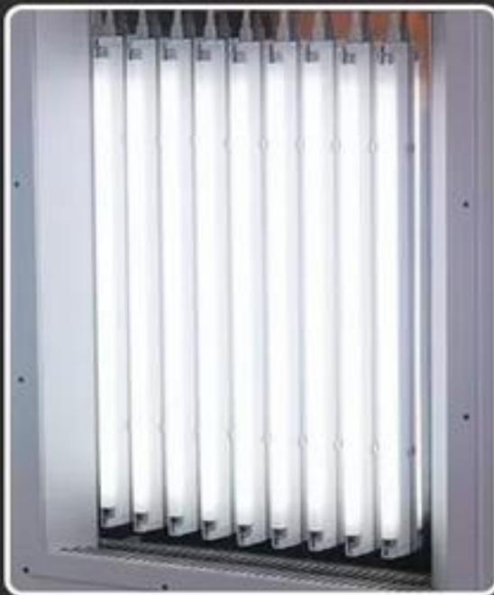
⬆ Lighting tube High-intensity fluorescent lamp, adjustable in illuminance