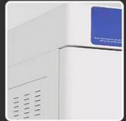
⬆ Cold rolled steel plate Shell using environmentally friendly electrostatic treatment, high quality cold rolled steel plate