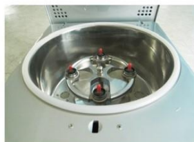
PRP Kit Ready to Spin