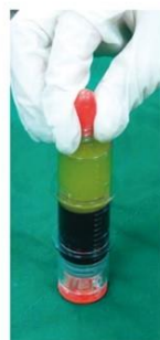
Red Blood Cell PRP