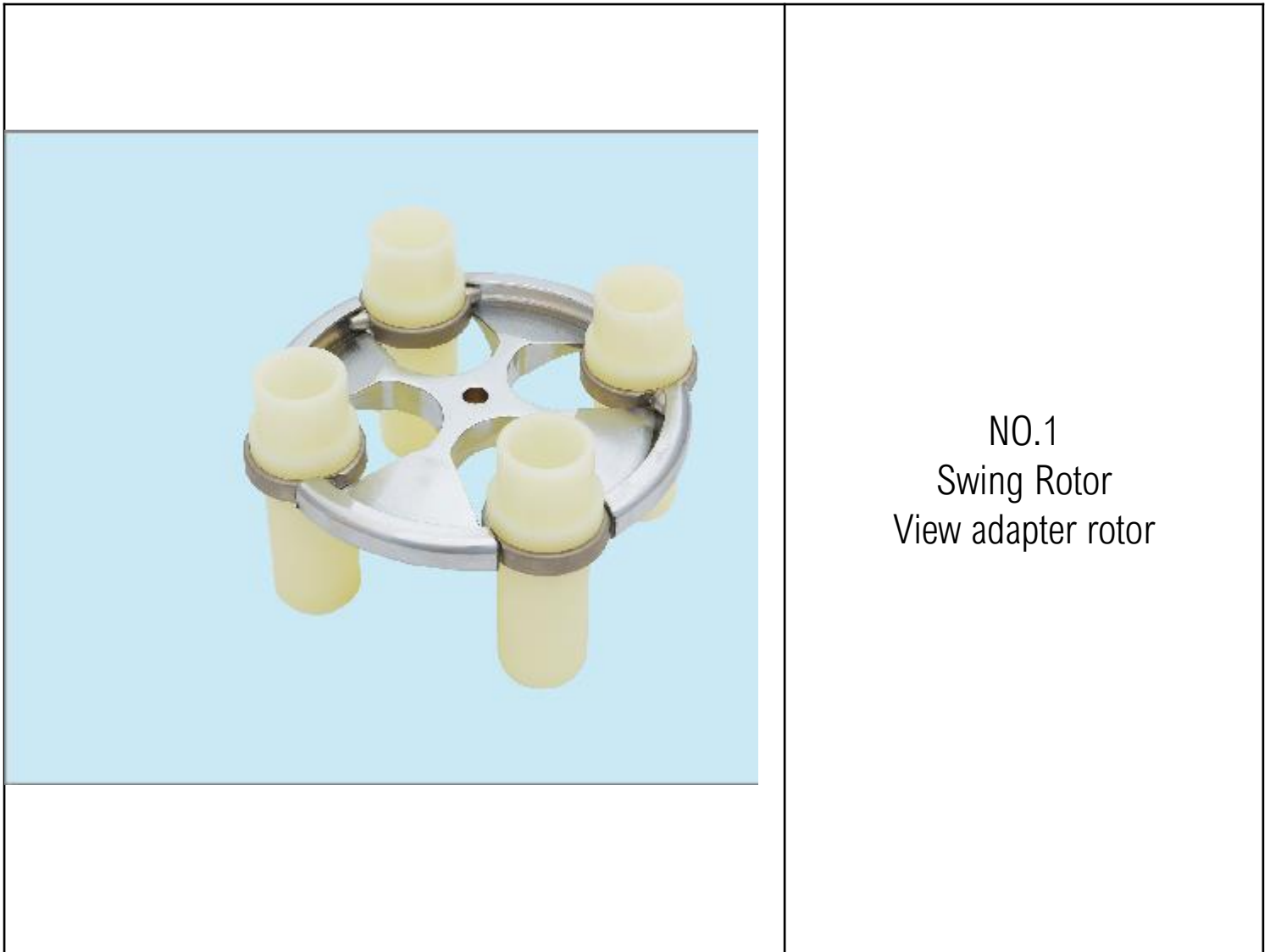
NO.1 Swing Rotor View adapter rotor