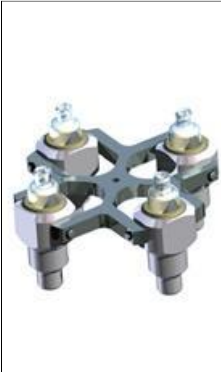
NO.1 Swing Rotor View adapter rotor