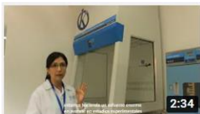
Kalstein France - Jacinto Convit Foundation / Alliances 23 views • 3 years ago