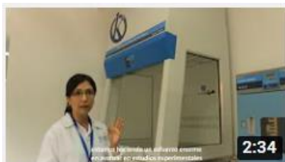
Kalstein France - Jacinto Convit Foundation / Allianc... 23 views • 3 years ago