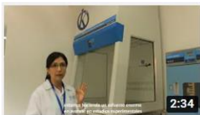
Kalstein France - Jacinto Convit Foundation / Allianc... 23 views • 3 years ago