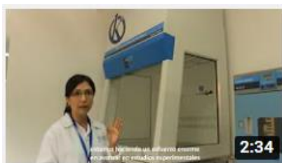
Kalstein France - Jacinto Convit Foundation / Allianc...