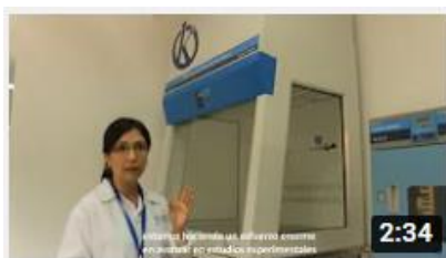
Kalstein France - Jacinto Convit Foundation / Alliances