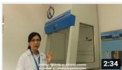
Kalstein France - Jacinto Convit Foundation / Allianc... 23 views • 3 years ago