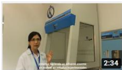
Kalstein France - Jacinto Convit Foundation / Alliances... 23 views • 3 years ago