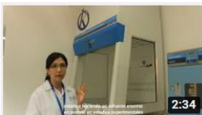
Kalstein France - Jacinto Convit Foundation / Alliances