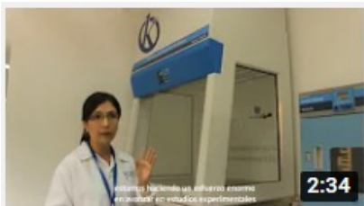
Kalstein France - Jacinto Convit Foundation / Alliances