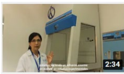
Kalstein France - Jacinto Convit Foundation / Allianc... 23 views • 3 years ago