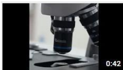
Kalstein's Microscopes 445 views • 1 week ago