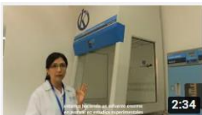
Kalstein France - Jacinto Convit Foundation / Allianc... 23 views • 3 years ago