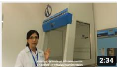
Kalstein France - Jacinto Convit Foundation / Alliances