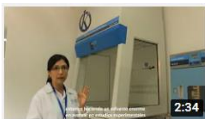
Kalstein France - Jacinto Convit Foundation / Alliances 23 views • 3 years ago